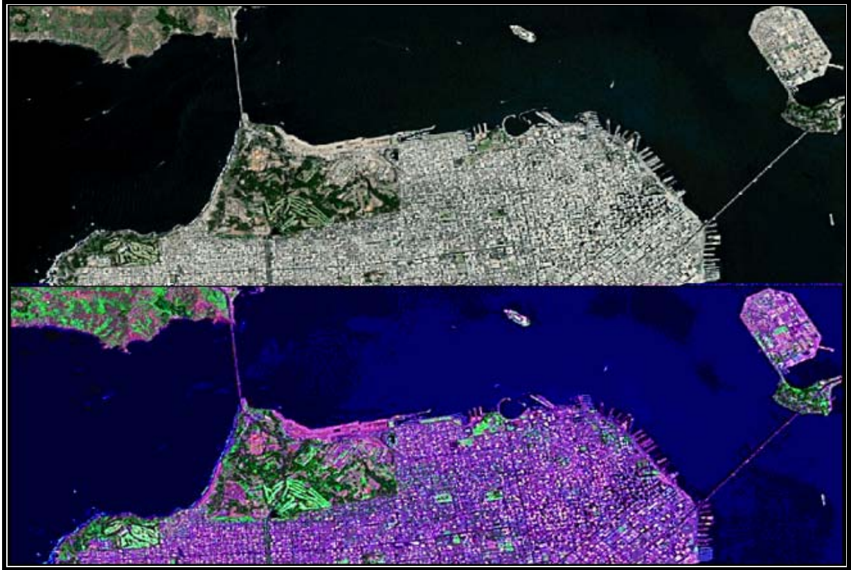
Figure 4: Downtown San Francisco (Showing Golden Gate & Bay Bridges) showing NaturalVue-Rev2 (Top) vs. 742 composite (Bottom)